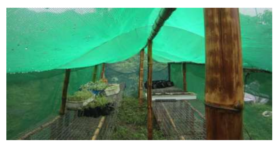
Inside view of the Veivueti Youth Club nursery at Tokou Village on Ovalau, Lomaiviti

The group used plastic planter bags (PBS) and local potting media to germinate 500 yaqona cuttings which have been transplanted in the field. They also raised cabbage and capsicum which was harvested and sold in the village. They also transplanted 50 Taiwan variety of guavas within the village grounds.