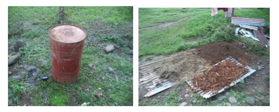
Soil prepared for fumigation by Vani Naucukidi of Nasaumatua Village