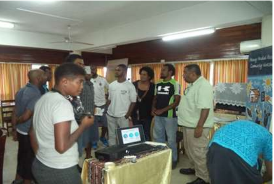
Financial Literacy Training at Ratu Cakobau House conference room