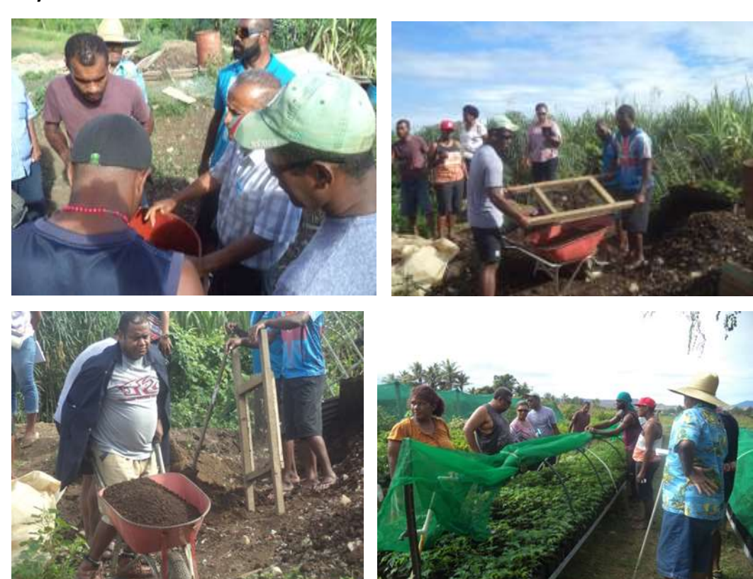
Farmers participate in the soil sterilisation process