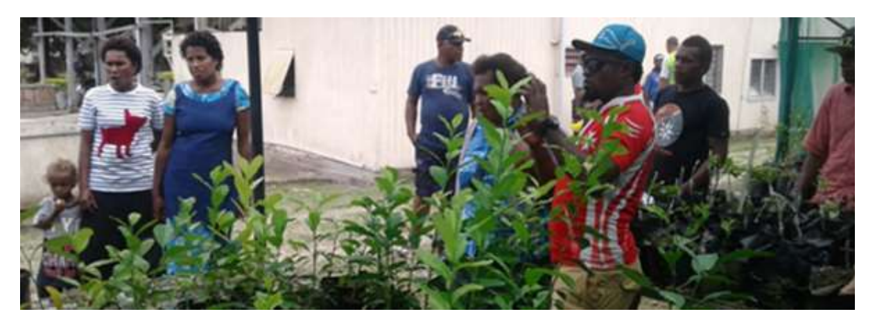
Picture 4: Farmers look at grafting work done by the Ministry's research department.

This is one of the activities that the research department is carrying out in order to have planting materials readily available. Most of the grafting work is done on citrus and mango, some varieties that are new and those that slowly fading away. Research officers use this technique to produce more planting materials and it also takes a shorter time for the trees to bear fruit.