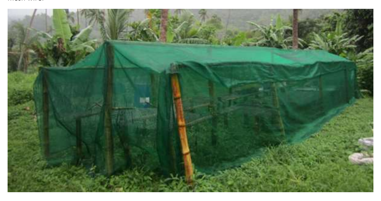
Veivueti Youth Club nursery at Tokou Village on Ovalau, Lomaiviti

The nursery expert visited the group on Monday, 6 November 2017, to determine the progress made so far and give any advice needed. After receiving the sarlon cloth from the Ministry of Youth & Sports, the group constructed a nursery 20m x 4m with local bamboo. They also constructed 2 benches made of bamboo and mesh wire.