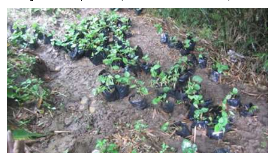
Yaqona seedlings under the bamboo trees

The group had received some yaqona planting material from the province of Serua via the Ministry of Agriculture and these had been germinated under the cool shade of a bamboo tree. About half of the stems planted died and the remainder are shown in the photo below. The farmers were advised to place the seedlings in the nursery so that they could harden and then be transplanted in the field.